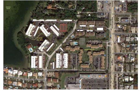
Built in 1979/1990 - 246 units - 5 floors

Costa Del Sol Owners Association 5801 North Banana River Blvd #958 Cape Canaveral, FL 32920 Phone: 321-799-4575 Fax: 321-799-4510 costadelsol@cfl.rr.com https://www.costadelsolcc.org/