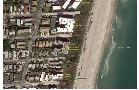
Built in 1997 - 37 units - 5 floors

Number of units: 37 Number of active listings for rent: 0 Number of active listings for sale: 0 Building inventory for sale: Number of sales over the last 12 months: 0% Number of sales over the last 6 months: 0 Number of sales over the last 3 months: 0