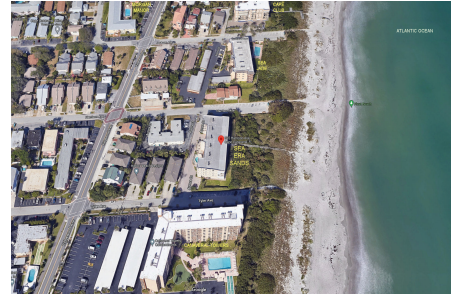
Built in 1996 - 24 units - 5 floors

Sea Era Sands Condominium Association, Inc. 555 Harrison Ave Cape Canaveral 32920