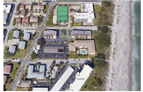
Built in 1985 - 30 units - 3 floors

Number of units: 30 Number of active listings for rent: 0 Number of active listings for sale: 0 Building inventory for sale: Number of sales over the last 12 months: 0%% Number of sales over the last 6 months: 0 Number of sales over the last 3 months: 0