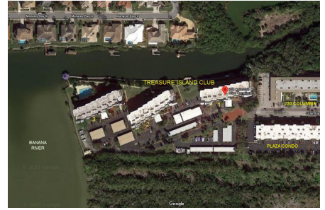
Built in 1985/1992 - 114 units - 5 floors

Treasure Island Club Address: 300 Columbia Dr #3105, Cape Canaveral, FL 32920 Phone: +1 321-783-2777