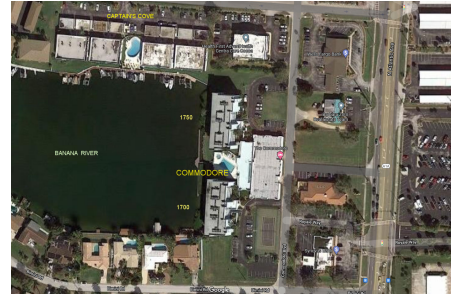
Built in 1984 - 50 units - 5 floors

Number of units: 49 Number of active listings for rent: 0 Number of active listings for sale: 0 Building inventory for sale: Number of sales over the last 12 months: 0% Number of sales over the last 6 months: 0 Number of sales over the last 3 months: 0