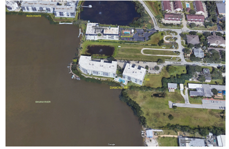
Built in 1994 - 44 units - 5 floors

Diamond Bay Condo Association 190 Pinellas LN #511A Cocoa Beach, FL 32931 https://www.diamondbaycocoabeach.com/