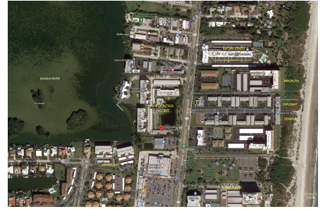
Built in 1985 - 114 units - 5 floors

Fountain Cove Condominium Address: 3165 N Atlantic Ave, Cocoa Beach, FL 32931 Phone: +1 321-784-5434 https://fountaincove.com/welcome