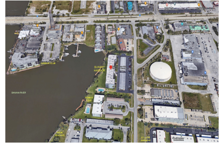
Built in 1985 - 45 units - 5 floors

Sunset Harbor Condos 3873 S Banana River Blvd #5000 Cocoa Beach, Florida 32931 http://www.sunsetharborcb.com/