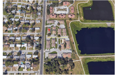
Built in 1981 - 68 units - 2 floors

Number of units: 68 Number of active listings for rent: 0 Number of active listings for sale: 0 Building inventory for sale: Number of sales over the last 12 months: 0% Number of sales over the last 6 months: 0 Number of sales over the last 3 months: 0