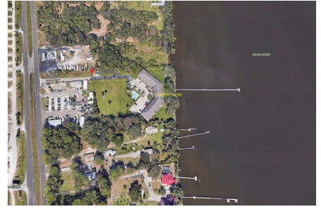
Built in 1984 - 24 units - 2 floors

Number of units: 24 Number of active listings for rent: 0 Number of active listings for sale: 0 Building inventory for sale: Number of sales over the last 12 months: 0%% Number of sales over the last 6 months: 0 Number of sales over the last 3 months: 0