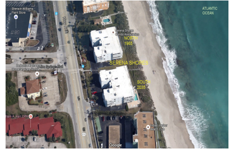
Built in 2003 - 16 units - 4 floors

Serena Shores Condo Association Inc Address: 1965 A1A Indian Harbour Beach, FL 32937, Phone: +1 321-773-7715