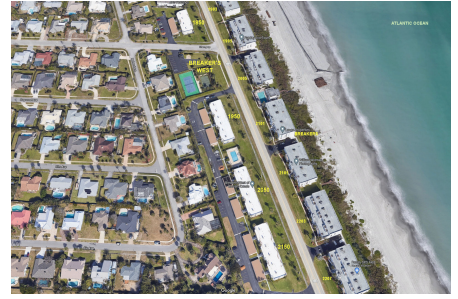
Built in 1981 - 43 units - 2 floors

Breakers West Condo Association 2050 Atlantic St Melbourne Beach, FL 32951 (321) 984-0190 (321) 727-0007