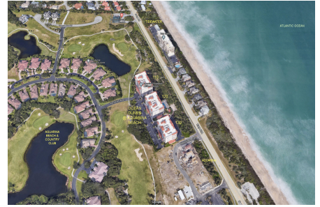
Built in 2008 - 84 units - 8 floors

Ocean Dune At Aquarina Condo Address: 140 Warsteiner Way, Melbourne Beach, FL 32951 Phone: +1 321-728-3291 https://www.oceandunesataquarina.com/