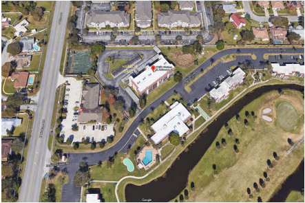
Built in 1981 - 24 units - 4 floors