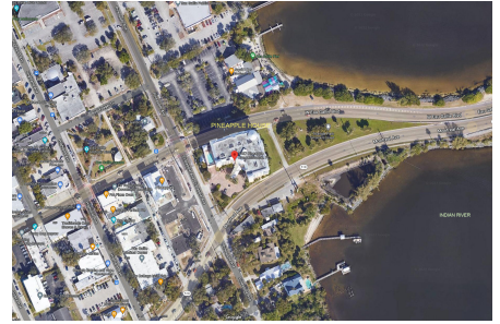
Built in 2007 - 33 units - 8 floors

PINEAPPLE HOUSE CONDOMINIUM ASSOCIATION, INC 7145 TURNER ROAD SUITE 101 ROCKLEDGE, FL 32955