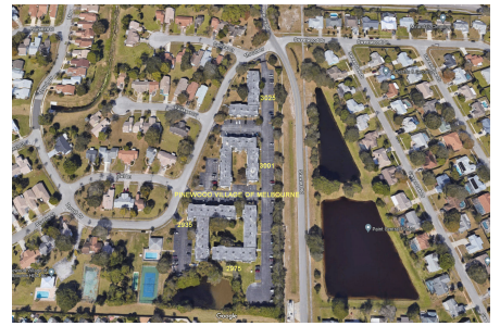
Built in 1981/1985 - 92 units - 2 floors

Pinewood Village of Melbourne HOA Address: 1713 Thrush Dr, Melbourne, FL 32935 Phone: +1 321-213-2232 http://www.pinewoodvillagehoa.com/home.html