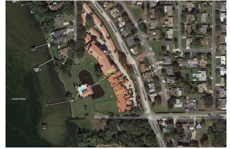
Built in 1990/2003 - 42 units - 4 floors

Island Cove Condominiums Address: 333 N Tropical Trail, Merritt Island, FL 32953 Phone: +1 321-454-3283