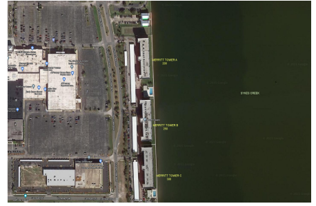
Built in 1989 - 224 units - 8 floors

Merritt Towers Inc Address: 300 S Sykes Creek Pkwy, Merritt Island, FL 32952 BP Davis Property Management, Inc. 321-784-2091