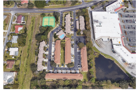
Built in 1984/2006 - 59 units - 2 floors