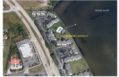
Built in 1986 - 76 units - 2 floors

Sunrise Landing Condominium Association Address 7350 N Highway 1 Cocoa, Florida 32927 Phone +1 321-639-3360