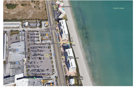
Built in 2019 - 108 units - 10 floors

Oceana Oceanfront Condo Address: 1045 Florida A1A, Satellite Beach, FL 32937 Phone: +1 321-614-2942