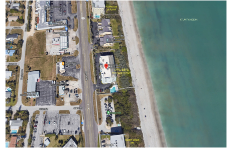
Built in 2002 - 20 units - 6 floors

Number of units: 20 Number of active listings for rent: 0 Number of active listings for sale: 0 Building inventory for sale: Number of sales over the last 12 months: 0% Number of sales over the last 6 months: 0 Number of sales over the last 3 months: 0