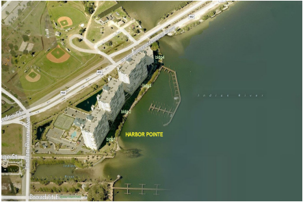
Built in 2005 - 68 units - 12 floors

Harbour Pointe Address: 7 Indian River Ave # 702, Titusville, FL 32796 Phone: 321-267-9400 http://www.harborpointefl.com/