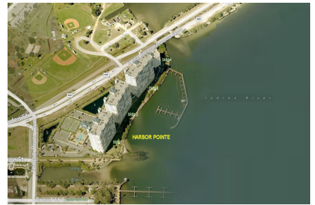
Built in 2006 - 70 units - 12 floors

Number of units: 70 Number of active listings for rent: 0 Number of active listings for sale: 0 Building inventory for sale: Number of sales over the last 12 months: 0% Number of sales over the last 6 months: 0 Number of sales over the last 3 months: 0