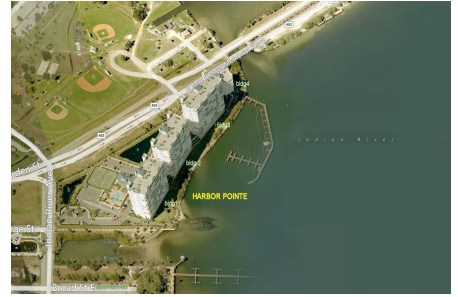
Built in 2007 - 72 units - 12 floors