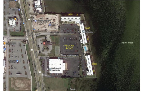
Built in 1985 - 132 units - 4 floors