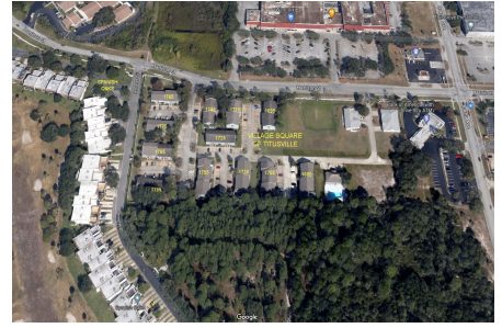
Built in 1983/1988 - 104 units - 2 floors

Village Square of Titusville Address: 1655 Harrison St, Titusville, FL 32780 Phone: +1 321-269-4250