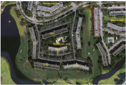
Built in 1981/1983 - 328 units - 4 floors

ARUBA VILLAGE CONDOMINIUM ASSOCIATION, INC 1310 AVENUE OF THE STARS COCONUT CREEK, FL 33066