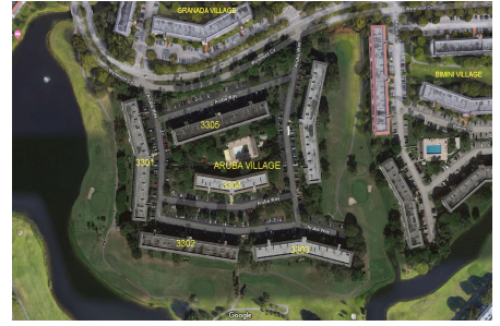
Built in 1981/1983 - 328 units - 4 floors

ARUBA VILLAGE CONDOMINIUM ASSOCIATION, INC 1310 AVENUE OF THE STARS COCONUT CREEK, FL 33066