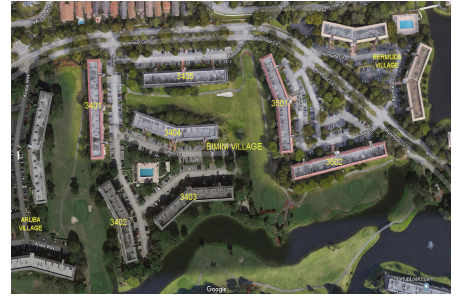
Built in 1983/1986 - 376 units - 4 floors

Bimini Village Condominium Association 1310 Avenue Of The Stars Coconut Creek, FL 33066 Phone: (954) 978-2608