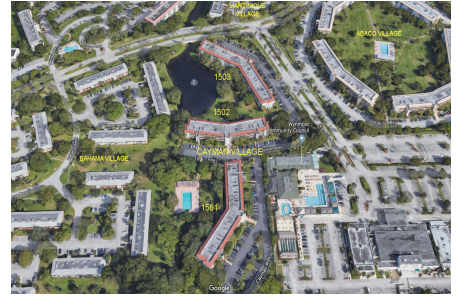
Built in 1987/1988 - 144 units - 4 floors