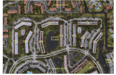
Built in 1980/1981 - 544 units - 4 floors