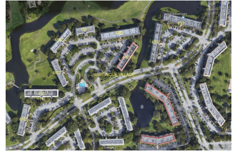
Built in 1976/1978 - 360 units - 4 floors

Martinique Village Association Inc 1310 Avenue Of The Stars Coconut Creek, FL 33066 Phone: (954) 978-2600