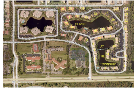
Built in 1995/2006 - 372 units - 2 floors

Number of units: 372 Number of active listings for rent: 1 Number of active listings for sale: 1 Building inventory for sale: 0% Number of sales over the last 12 months: 0 Number of sales over the last 6 months: 0 Number of sales over the last 3 months: 0