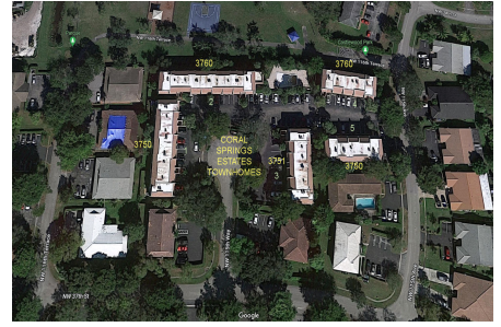
Built in 2005 - 50 units - 2 floors