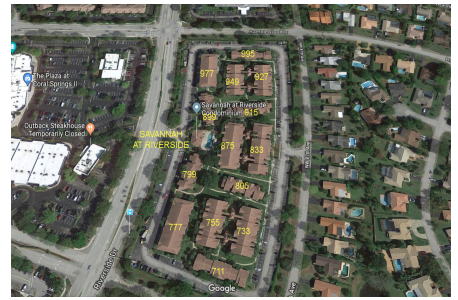
Built in 1988 - 240 units - 3 floors