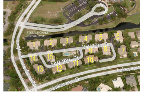
Built in 1993 - 60 units - 2 floors

STEEPLECHASE ASSOCIATION 1000 Eagle Trace Blvd. Coral Springs, FL 33071 Phone: (954) 796-5013 Fax: (954) 341-6129 http://www.eagle-trace.com/