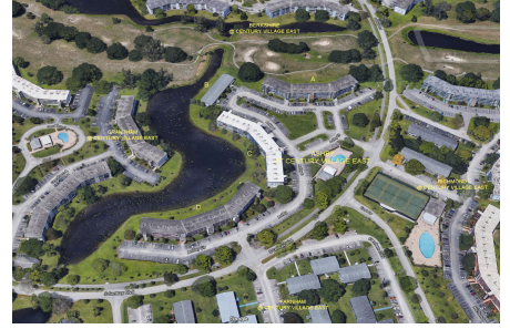
Built in 1975 - 228 units - 4 floors

Number of units: 228 Number of active listings for rent: 0 Number of active listings for sale: 3 Building inventory for sale: 1% Number of sales over the last 12 months: 8 Number of sales over the last 6 months: 3 Number of sales over the last 3 months: 3