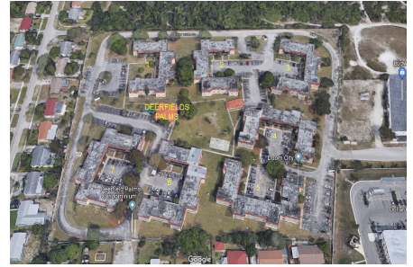
Built in 1975 - 168 units - 2 floors

Deerfield Palms Condominium Association 4613 N University Dr #482, Coral Springs, FL 33067 (877) 211-8244 https://deerfieldpalms.com/