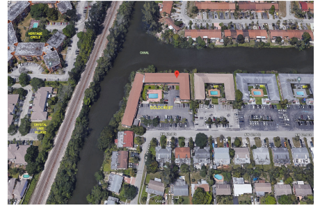
Built in 2007 - 40 units - 2 floors