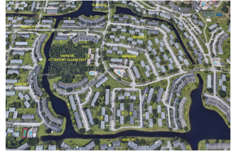
Built in 1974/1978 - 688 units - 4 floors