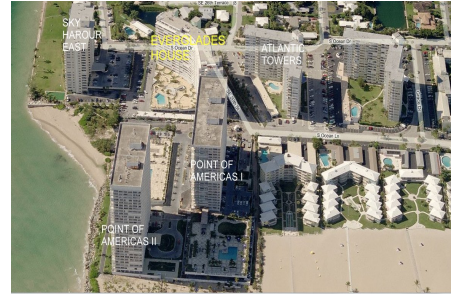
Built in 1966 - 160 units - 18 floors

Everglades House Condominium Association, Inc. (954)525-6391