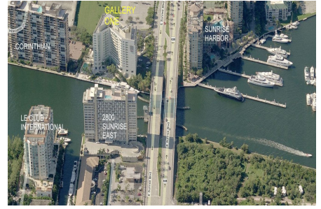
Built in 2006 - 231 units - 13 floors