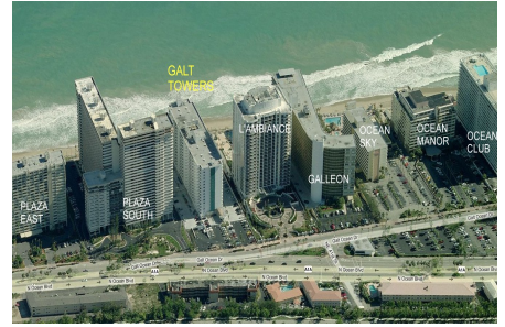
Built in 1979 - 260 units - 15 floors

Galt Towers Condominium Association (954) 563-7268