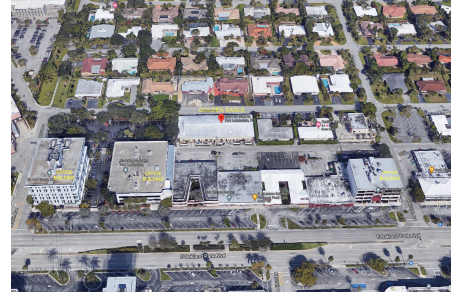
Built in 1979 - 23 units - 2 floors

Golden Eagle Condo Address: 2624 NE 32nd St, Fort Lauderdale, FL 33306