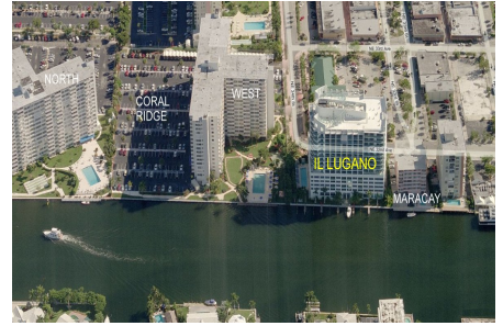
Built in 2007 - 23 units - 14 floors