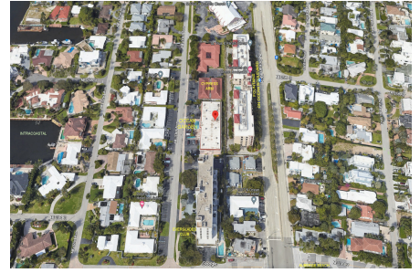
Built in 1984 - 24 units - 2 floors

Ocean Garden Condominium Association Inc 2400 Ne 33rd Ave Fort Lauderdale, FL 33305-1887