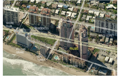
Built in 2001 - 96 units - 31 floors

Palms Tower 2 Condo Association (954) 565-9811