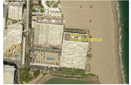
Built in 1970 - 281 units - 30 floors

Point of Americas 2 apartments (954) 522-5446 http://www.pointofamericas2.com/