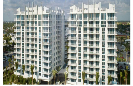
Built in 2009 - 86 units 12 floors

Sapphire Fort Lauderdale Condo Association (954) 537-1837